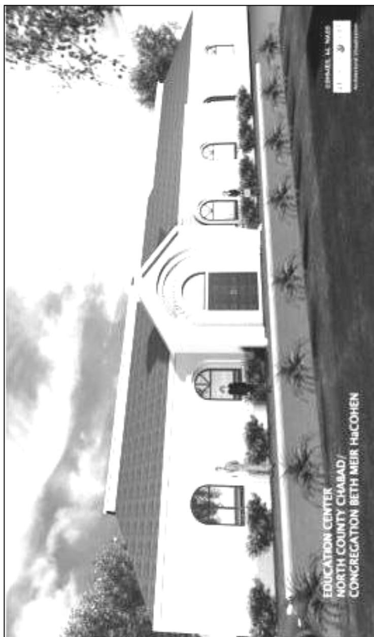
New Education Center Architectural Rendering