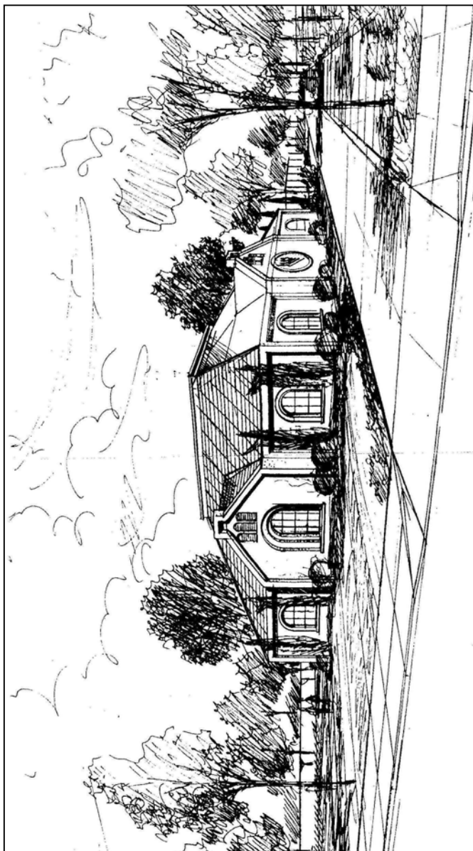
Artist's Rendering of the New Chabad Center