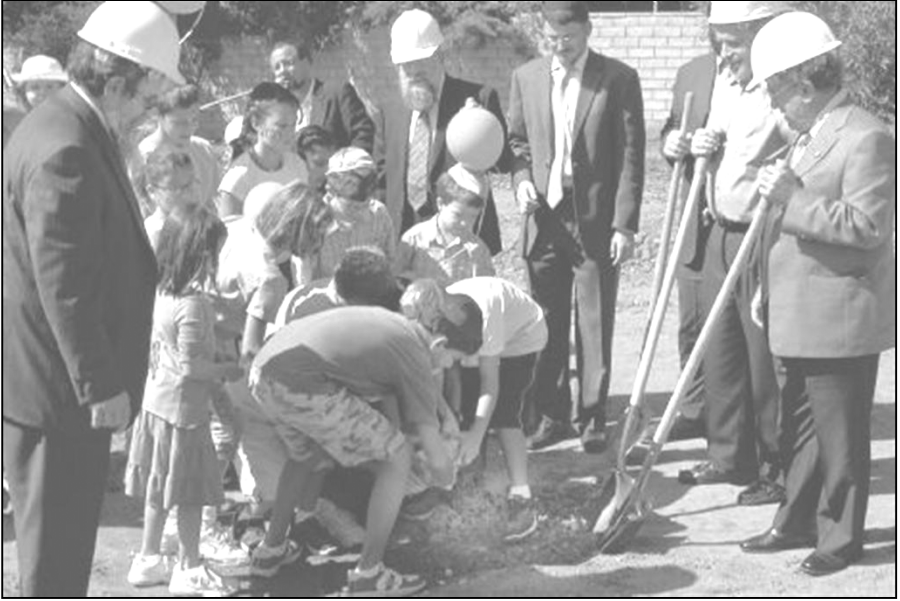
September 25, 2005. Our children, the future of our Congregation, are placing the Jerusalem Cornerstone for the Education Building.