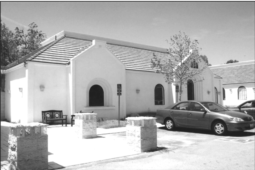
New Extension to Sanctuary (social hall, library, new lobby, and kitchen) (September 2007)