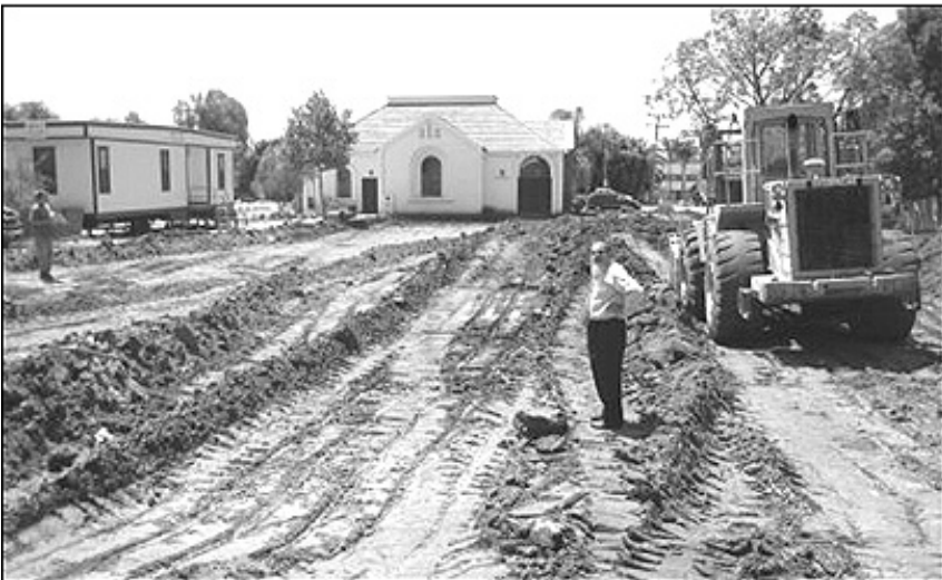
Rabbi Eliezrie surveying the lot during grading, prior to excavation for the foundations of the new building.