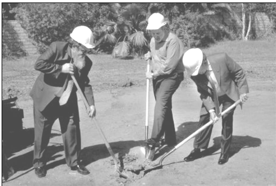
September 25, 2005. Groundbreaking Ceremony and beginning of Cornerstone Ceremony for our Synagogue expansion project.