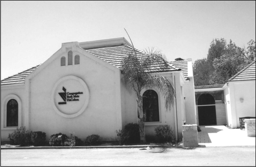
Remodeled entrance door to Congregation Beth Meir HaCohen / North County Chabad (September 2007)