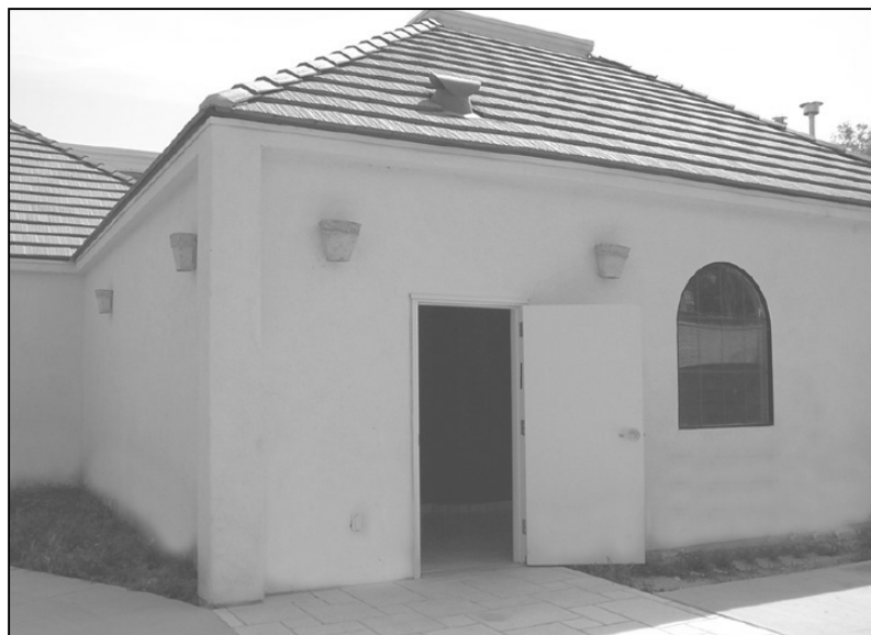
Entrance to the New Mikvah