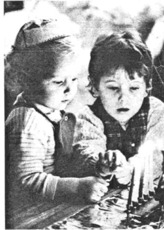
CHANUKAH IS COMING, SEE PAGES 4 & 5

Shabbos Services will be held at the facility starting December 3. Friday night services at 6P.M. and Shabbos morning at 9:30 A.M.. The help celebrate the opening of the new center the Megama, who will be appearing in concert Saturday evening, will be joining the community. There will be a special Kiddush after services Shabbos morning, all are invited.