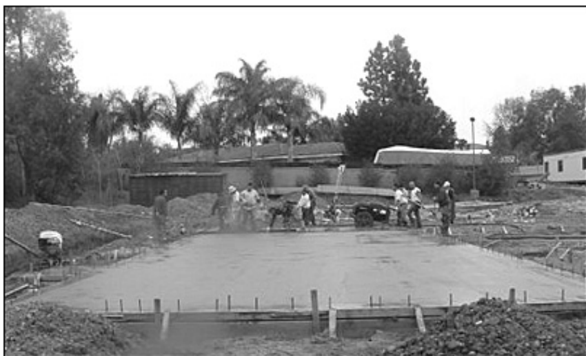
The concrete slab for the new building, just after being poured