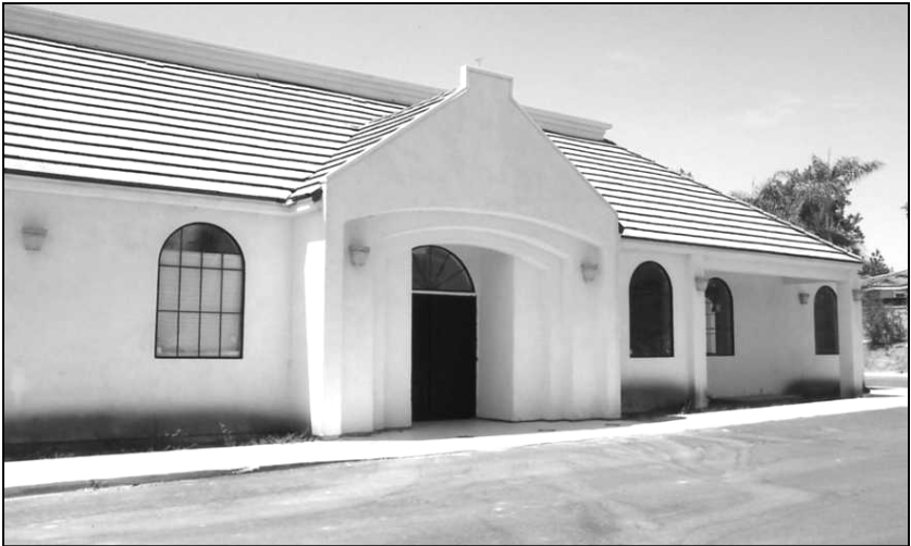
New Education Building