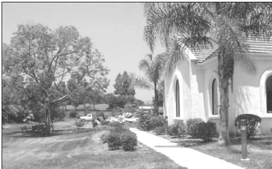
Looking north, along the grassy field, to the back of the property, behind the Sanctuary.