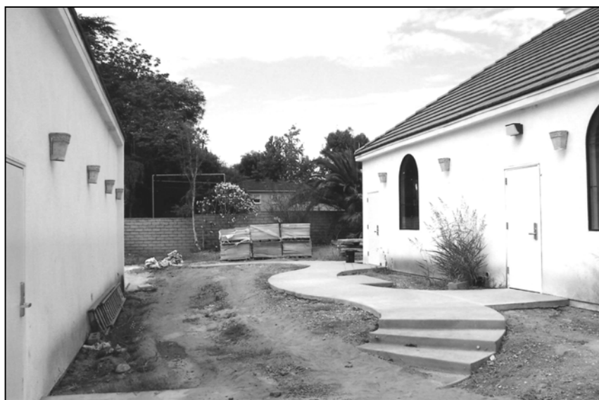
Unfinished Landscaping between the Social Hall and the Education Building (September 2007)