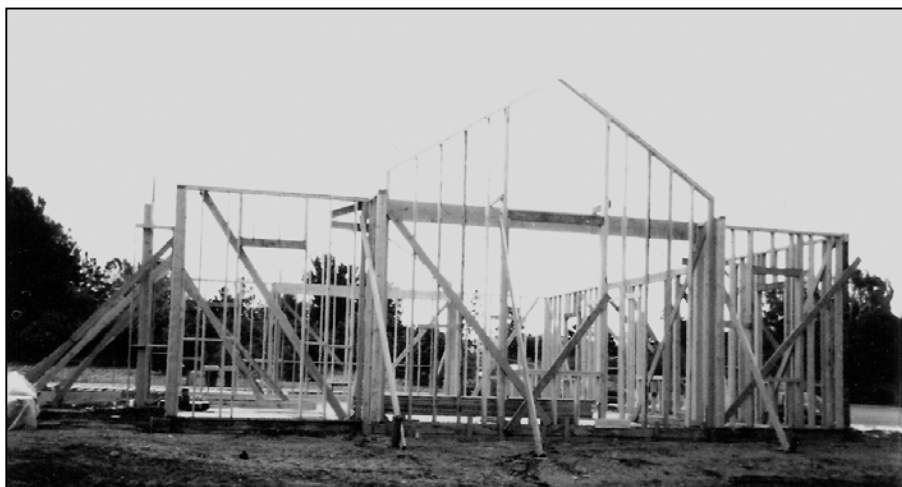
The Beginning of the New Chabad Sanctuary