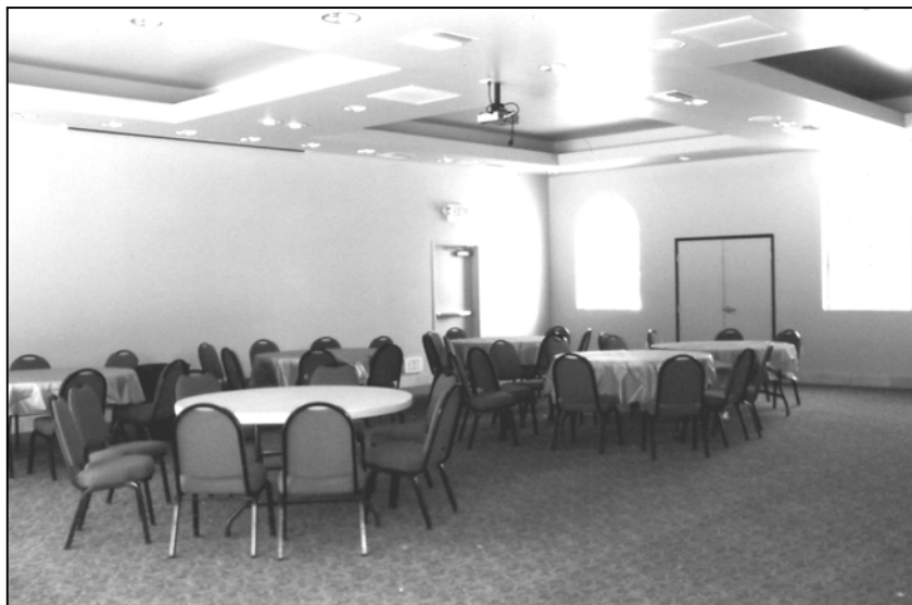
New Social Hall