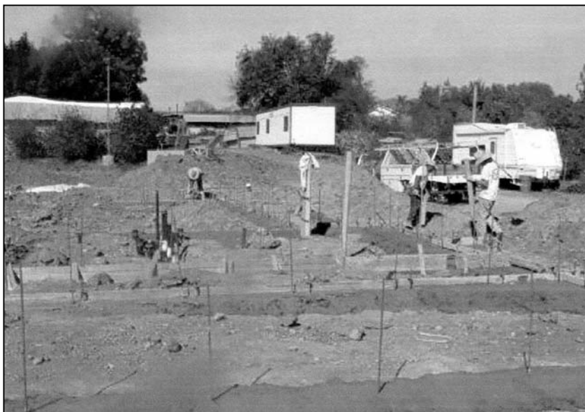
Preparation for the new foundation