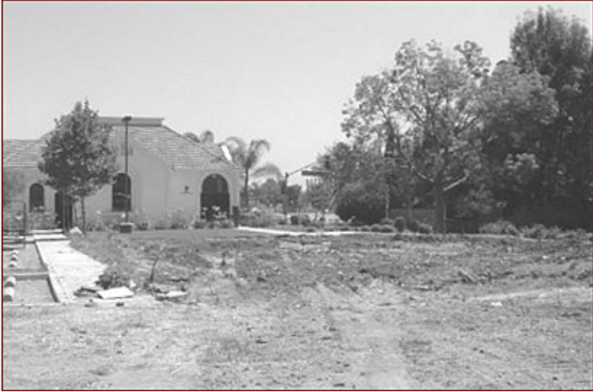
Before construction begins, an empty lot filled with expectations for our new building.