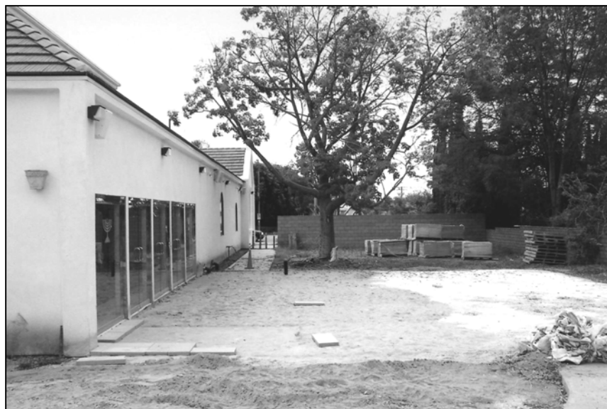
Unfinished Landscaping Behind the Social Hall (September 2007)