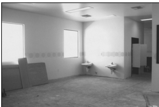
Kitchen and Pre-School Classroom, Unfinished (September 2007)